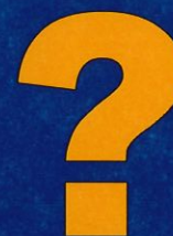
3rd Keynote Speaker TBA